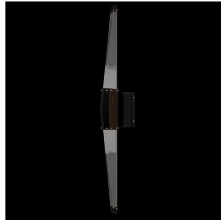
Shown in black / dark walnut

LAMP COLOR . . . . . 3000K LUMENS/WATT . . . . . 193.33 LUMINOUS FLUX . . . . . 696 lumens