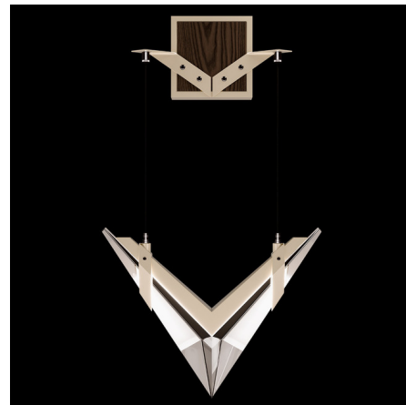
Shown in champagne / dark walnut