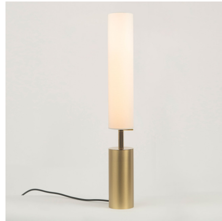
Shown in satin brass / white

Taking its name from a French word for cigarettes, the Clopes Table Lamp features an elongated, tubular linen shade atop a cylindrical metal base. The shade can be tilted side to side to create a slightly askew look, adding visual interest to the minimalist design. Composed of simple geometric cylinders, Clopes will complement a wide variety of decor styles. Dimmer switch located on cord.