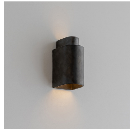
Shown in black

The Can Wall Sconce combines heritage and tradition with a modern twist. Handcrafted from Oaxaca barro negro clay, the tubular shape is characterized by a black color that comes from the smoke during the firing process. Handcrafted in Mexico. Note: Does not fit on a standard 4in junction box.