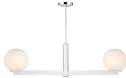
Shown in chrome / white