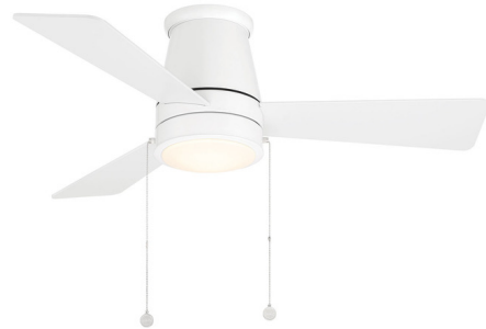
Shown in matte white / frosted