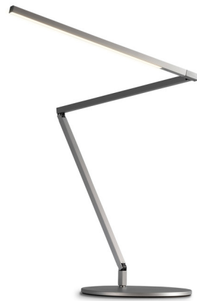
Shown in brushed aluminum

COLOR RENDERING . . . . . 90 CRI LAMP COLOR . . . . . Tunable White LUMENS/WATT . . . . . 96.14 LUMINOUS FLUX . . . . . 971 lumens