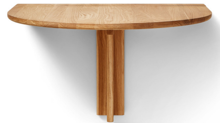
Shown in natural oak

The Folding Wall Table is a small oval wall table with a clever folding option for a tight space. The long slender oak frame and the solid oak supports hold the wooden wall table in place, creating an apparent contradiction of lightness and substantiality. The supports rest against the wall, adding to the floating expression and making it possible to sit around the table in comfort with much more leg room for everyone. The folding mechanism is well-designed and easy to operate for everyday use.