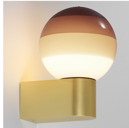
Shown in brushed brass / chocolate

The Dipping Light A1 Wall Sconce features an arm extending from the wall with a Brushed Brass finish that holds a round hand blown glass shade pointed towards the ceiling. Includes round junction box cover (not shown in every image).