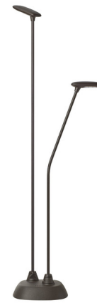
Shown in graphite brown