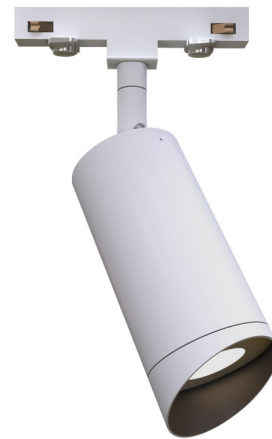
Shown in pure white