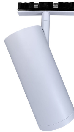
Shown in pure white