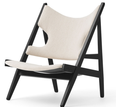
Shown in black oak / barnum boucle 24

The Knitting Lounge Chair Everyday Icons Editions is defined by the exposed triangular construction and gently curved seat with a high back that is pitched for relaxation. The chair takes its name from the cut outs in the seat back, originally conceived by designer Ib Kofod-Larsen to accommodate the movement of the arms while knitting. This special edition of the Knitting Lounge Chair features a black-stained oak frame and tactile boucle upholstery that gives a contemporary twist to the classic 1951 design.