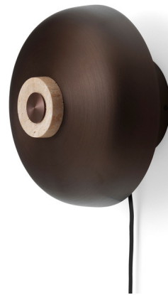
Shown in travertine / bronzed brass

PRODUCT DIMENSIONS . . . . . Backplate: 4.7" diameter COLOR RENDERING . . . . . 90 CRI LAMP COLOR . . . . . 3000K Warm Dim LUMENS/WATT . . . . . 30.00 LUMINOUS FLUX . . . . . 315 lumens