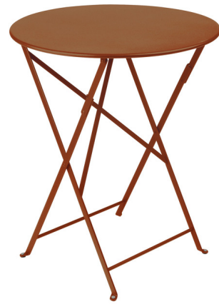
Shown in candied orange

The Bistro Plus Round Table is made of lacquered steel. This table was created in the 19th century in Europe, and has stood the test of time. Features a reinforced tabletop to improve resistance and strength, perfect for intensive commercial use.