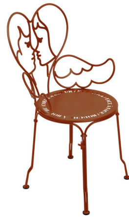
Shown in candied orange

In creating Ange, designer Jean-Charles de Castelbajac restyled the 1900 chair, one of the emblematic references of the Fermob catalogue. He offers us a kiss between two cherubs, and a poem that lies somewhere between Cocteau and Saint-Exupery. The designer invites you to take flight on this chair, with its wings spread wide... for a moment of escape among the clouds. Steel rod frame, Laser-cut steel sheet seat, Laser-cut steel backrest, Hand-forged wings and rings, Stacking capacity : x 3 (Height - stacked : 53 in.)