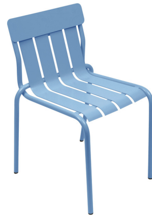
Shown in maya blue

Originally, the Stripe chair was developed by Fermob as part of a special project at the request of the designer Matali Crasset. She wanted to create a seat to encourage people to talk and share, and that would be easy to move from one table to another, for the new Mini R fast food concept of the student services organization CROUS. This is how Stripe came into being: an aluminum chair with gentle curves, comfortable to use with a handle on the back of the backrest. Tubular aluminum frame, Curved aluminum slats seat, Curved aluminum, slats backrest, Handle on the back of the backrest for easier handling, Silence pads, Stacking capacity : x 8 (Height - stacked : 43,5 in.), Product enhancement : Improved stacking