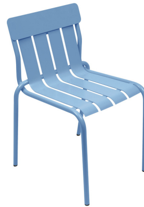
Shown in maya blue

Originally, the Stripe chair was developed by Fermob as part of a special project at the request of the designer Matali Crasset. She wanted to create a seat to encourage people to talk and share, and that would be easy to move from one table to another, for the new Mini R fast food concept of the student services organization CROUS. This is how Stripe came into being: an aluminum chair with gentle curves, comfortable to use with a handle on the back of the backrest. Tubular aluminum frame, Curved aluminum slats seat, Curved aluminum, slats backrest, Handle on the back of the backrest for easier handling, Silence pads, Stacking capacity : x 8 (Height - stacked : 43,5 in.), Product enhancement : Improved stacking