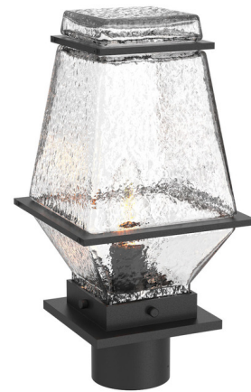
Shown in textured black / clear hammered

The Landmark Outdoor Post Light brings a contemporary look to a classic lantern style. The band detailing surrounds beautiful hand blown hammered glass that casts warm shadows of light across your area. Standard post is required and sold separately below. The AAMA 2604-rated finishes provide long-lasting UV and corrosion resistance in coastal and other harsh climates and have a lifetime warranty.