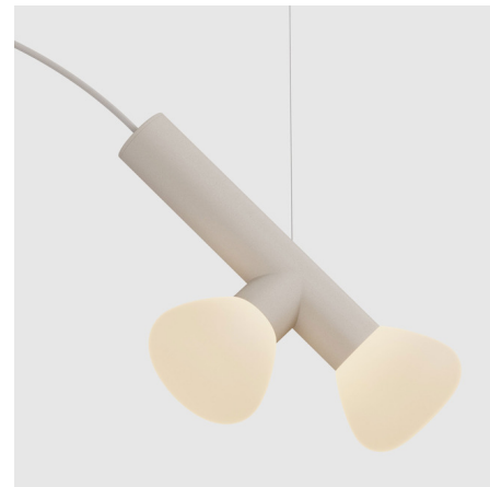
Shown in beige / frosted

COLOR RENDERING . . . . . 80 CRI LAMP COLOR . . . . . 2700K LUMENS/WATT . . . . . 81.78 LUMINOUS FLUX . . . . . 368 lumens