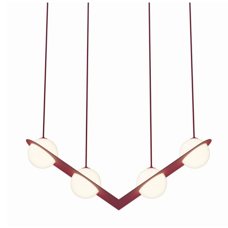
Shown in burgundy / opal