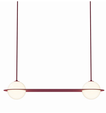
Shown in burgundy / opal

COLOR RENDERING . . . . . 90 CRI LAMP COLOR . . . . . 2700K LUMENS/WATT . . . . . 141.78 LUMINOUS FLUX . . . . . 638 lumens