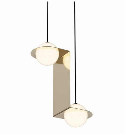
Shown in brass / opal