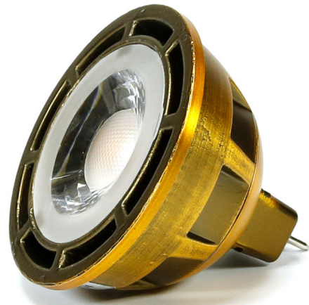
Shown in aged brass

The Sunlight2 MR16 GU5.3 Base is an architectural-grade 12 Volt LED bulb featuring low blue emission and no flicker. Designed with Dim-to-Warm (3000K-1800K) color temperature, SunLight2 gradually changes from 3000K color temperature to a warm sunset 1800K ambiance. Phase dimming 100%-0.1%. Note: Sold as a 2-pack.