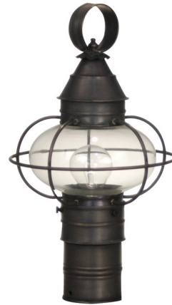
Shown in dark brass / clear

The Caged Onion Clear Outdoor Post Light brings a modern update to the traditional onion style for your exterior space. The handblown onion shaped glass globe is hugged by a double barreled cage, and casts warm shadows across your area. Standard 3 inch post is required and sold separately below.