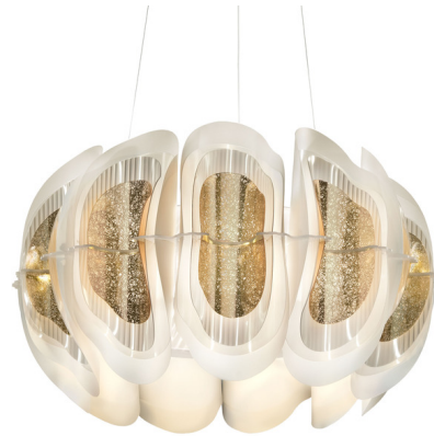
Shown in white / gold

COLOR RENDERING . . . . . 90 CRI LAMP COLOR . . . . . 2700K LUMENS/WATT . . . . . 119.44 LUMINOUS FLUX . . . . . 4300 lumens