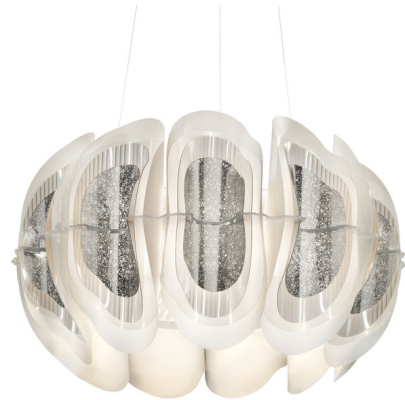
Shown in white / silver

COLOR RENDERING . . . . . 90 CRI LAMP COLOR . . . . . 2700K LUMENS/WATT . . . . . 119.44 LUMINOUS FLUX . . . . . 4300 lumens