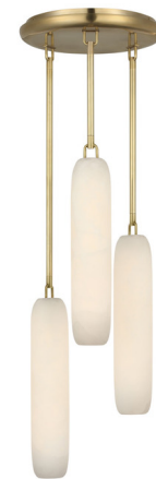
Shown in antique burnished brass / alabaster

PRODUCT DIMENSIONS: Two 8" and One 12" for each Individual Pendant Included LAMP COLOR . . . . . 2700K LUMENS/WATT . . . . . 420.24 LUMINOUS FLUX . . . . . 4900 lumens