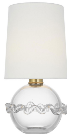
Shown in clear / linen

LAMP COLOR . . . . . 2700K LUMENS/WATT . . . . . 156.25 LUMINOUS FLUX . . . . . 250 lumens