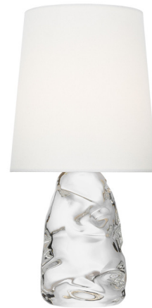
Shown in clear / linen

LAMP COLOR . . . . . 2700K LUMENS/WATT . . . . . 156.25 LUMINOUS FLUX . . . . . 250 lumens