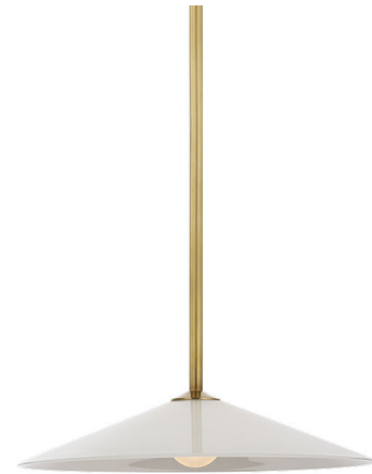
Shown in hand-rubbed antique brass / white glass

PRODUCT DIMENSIONS . . . . . Downrods: One 8" and Two 16" Included LAMP COLOR . . . . . 2700K LUMENS/WATT . . . . . 140.00 LUMINOUS FLUX . . . . . 700 lumens