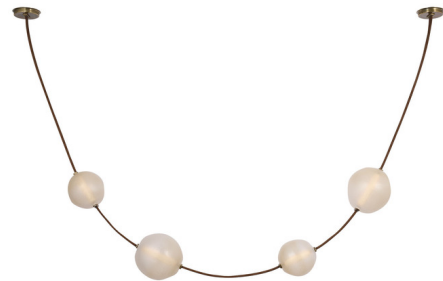
Shown in mottled brass / russet suede / fizzy nude

The Dune Pendant brings the beauty of jewelry to your home. The organic glass globes are strung on a suede strap that adds a farmhouse vibe and warm shadows of light across your room. Can be used with the second canopy to create your own unique swag, or left to hang straight down from your ceiling. Remote driver installation, see installation instructions.