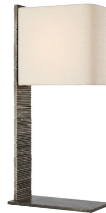
Shown in ridged graphite / boucle

The Fumar Statement Table Lamp brings a rustic farmhouse look to your interior space. The ridged frame, inspired by the bark of an aged tree, is complemented with an oval, rectangular boucle shade that casts warm shadows across your room. Dimmer switch is located on the socket.