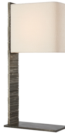
Shown in ridged graphite / boucle

The Fumar Statement Table Lamp brings a rustic farmhouse look to your interior space. The ridged frame, inspired by the bark of an aged tree, is complemented with an oval, rectangular boucle shade that casts warm shadows across your room. Dimmer switch is located on the socket.