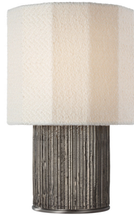
Shown in ridged graphite / boucle

The Fumar Table Lamp brings a rustic farmhouse look to your interior space. The ridged octagon body, inspired by the bark of an aged tree, is complemented with a matching octagon boucle shade that casts warm shadows across your room. Dimmer switch is located on the body.