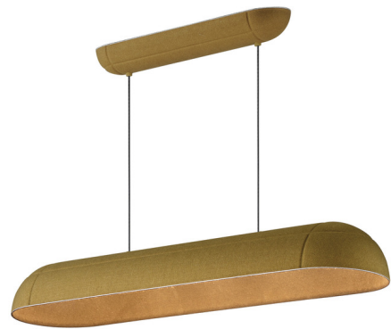
Shown in olive

Balancing work and play, the Wimbledon Pendant is a creative fusion of aesthetics and function. A dual-layered sound dampening felt shade enhances the acoustics of a space. Housed within, a high-powered LED module provides ample task light where needed. Perfect for a home office or any space that needs sound dampening. TRIAC and ELV dimming.