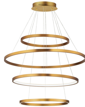
Shown in gold