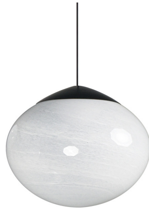
Shown in black / white

LAMP LIFE . . . . . 50000 hours COLOR RENDERING . . . . . 90 CRI LAMP COLOR . . . . . 3000K LUMENS/WATT . . . . . 97.78 LUMINOUS FLUX . . . . . 880 lumens