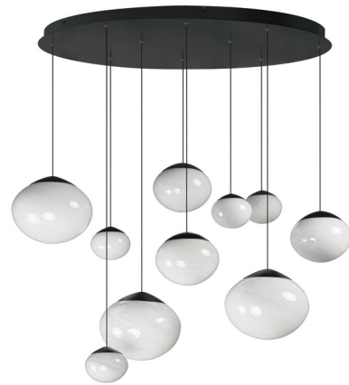
Shown in black / white