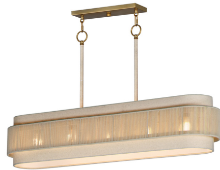
Shown in natural aged brass / off white

The Seacliff Linear Pendant fuses coastal charm with transitional elegance. Twisted cotton twine strands create the textural outer drum, while the off-white linen fabric shade gently filters light. The supporting rods are wrapped in matching rope-like material, accented with metal details to elevate the design.