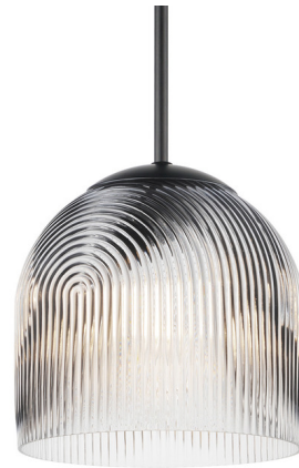
Shown in black / clear ribbed

Featuring a concentric, semicircular ribbed glass pattern, the Dune Pendant offers a fusion of nautical design with contemporary flair. The textured glass refracts light, diffusing glare while delivering ample illumination. Metal accents in a matte black finish enhance the modern aesthetic.