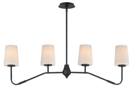
Shown in black / white

The Durham Linear Pendant features a modern update to a traditional silhouette. The knurled rod details add visual interest to the metal frame, while the glass shades provide even, soft illumination. Perfect for a dining room or kitchen island.