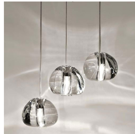
Shown in brushed nickel / clear / brushed nickel

The Mizu Round Multi Light Pendant is hand-made and inspired by tranquil and mesmerizing light refractions created by water. Like water droplets, no two Mizu fixtures are alike. Each crystal shape is unique. Made from 24 percent lead, the clearest crystal perfectly emulating water's refraction of light. NOTE: This is a discontinued model and limited to quantity on hand.