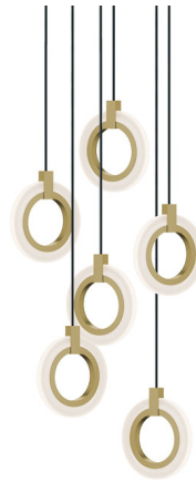
Shown in antique brass / frosted