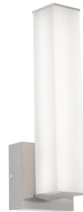
Shown in satin nickel / frosted

LAMP LIFE . . . . . 50000 hours COLOR RENDERING . . . . . 90 CRI LAMP COLOR . . . . . CCT Select LUMENS/WATT . . . . . 91.67 LUMINOUS FLUX . . . . . 1100 lumens