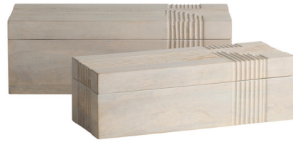
Shown in whitewash

The Kamira Box is dual oversized containers of whitewash mango wood offering an elegant storage solution. Carved linework cascades in a flowing effect over the sides to draw the eye to this neutral accessory. Hinge and chain interior closure.