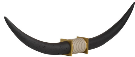
Shown in charcoal / grey

The Jacari Sculpture is inspired by a Texas longhorn steer. This elegant sculpture's linear shape makes an impact on a console or mantle. Each form of charcoal ricestone composite is securely mounted to a base of antique brass steel, accented with an inset of light gray leather for contrast.