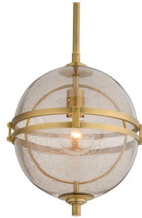
Shown in antique brass / smoke seeded

PRODUCT DIMENSIONS . . . . . Downrods: One 4", One 6" and Two 12" Included