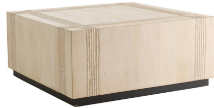
Shown in blackened bronze / white wash

The Kamira Cocktail Table has the woven effect of carved linework flowing over the top and sides showcases the handcrafted nature of this piece. Constructed of whitewash mango wood, it is secured to a contrasting blackened bronze iron base.