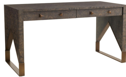
Shown in olive ash veneer

The Jupiter Desk seems to float within your room. The peak of each antique brass-tipped sled leg is carefully fitted to match the case for a seamless silhouette. Two double pencil drawers adorned with triangular stud hardware were designed to close softly. Finished front and back in truffle burl design of Olive Ash Veneer.