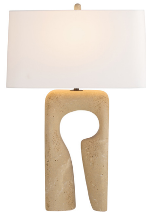
Shown in sand / off white