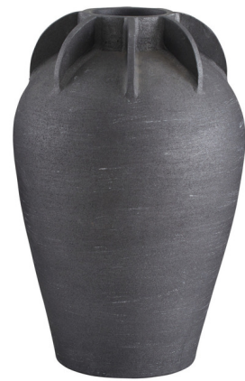
Shown in charcoal

The Gardenia Planter is reminiscent of a classic olive jar. Generously sized, this richly textured matte charcoal terracotta piece features armor-like embellishments around the opening. For convenient drainage, it includes a removable rubber stopper at the base.